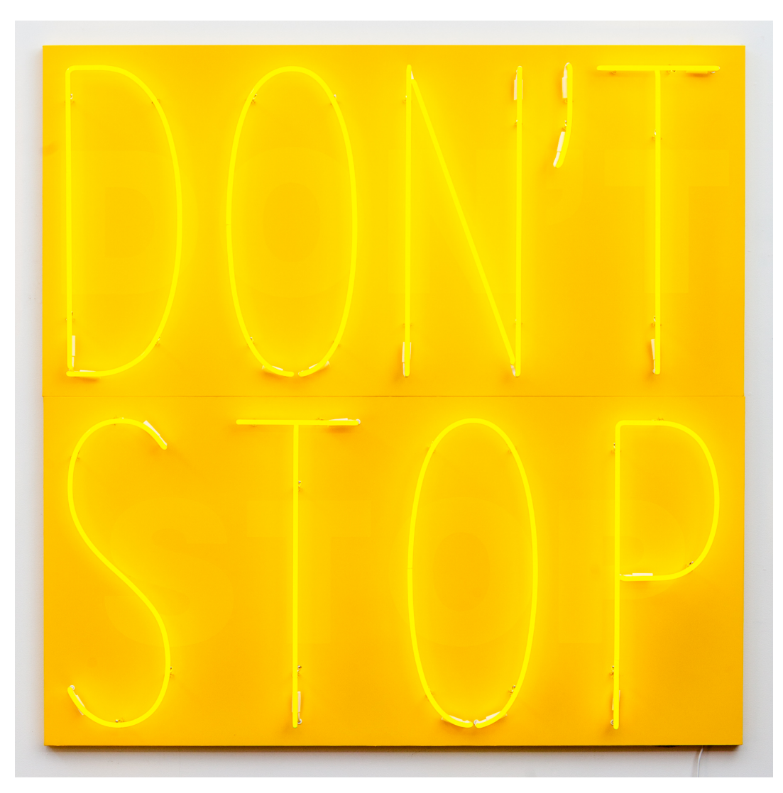
Don't Stop 3 (Yellow/Yellow), 2020, acrylic and neon on canvas, 72 x 72 inches

Kass first sketched DON'T STOP (2020) immediately after watching the finale of The Sopranos . Tony picks Journey's Don't Stop Believin ' on the jukebox as a possible assassin in a Members Only jacket walks out of the bathroom towards him, à la Michael Corleone in The Godfather . Kass knows, of course, the words are also in Michael Jackson's Don't Stop 'Til You Get Enough and countless other pop songs. Yet, it wasn't until the Trump era that she actually felt compelled to make these enlarged, neon versions of the piece. The phrase was something of a mantra to herself, about not giving up despite the overwhelming tragedy that is the Trump presidency.