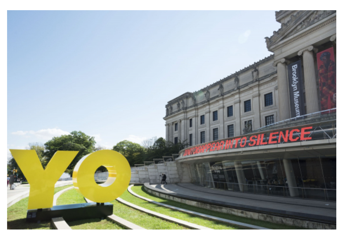
OY/YO installed at the Brooklyn Museum, 2019, Brooklyn, NY.